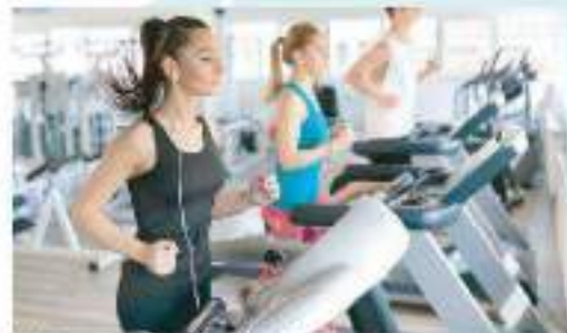
Work out with world-class equipments at the gymnasium