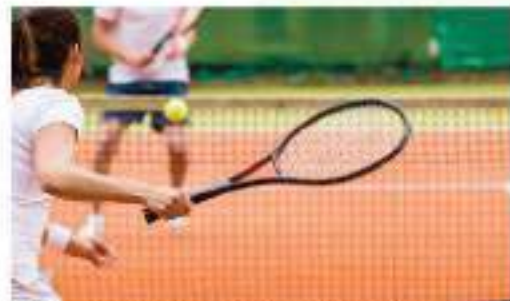
Relax and melt away the stress of life

Here SO MUCH TO OFFER, INDOORS AND OUTDOORS