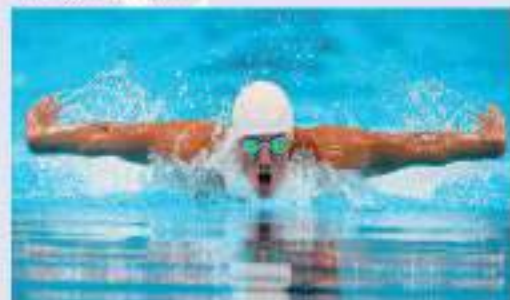
Immerse yourself in the calm waters of the 50m Infinity lap pool