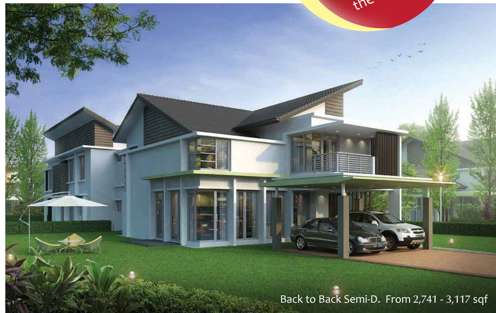
Back to Back Semi-D. From 2,741 - 3,117 sqf