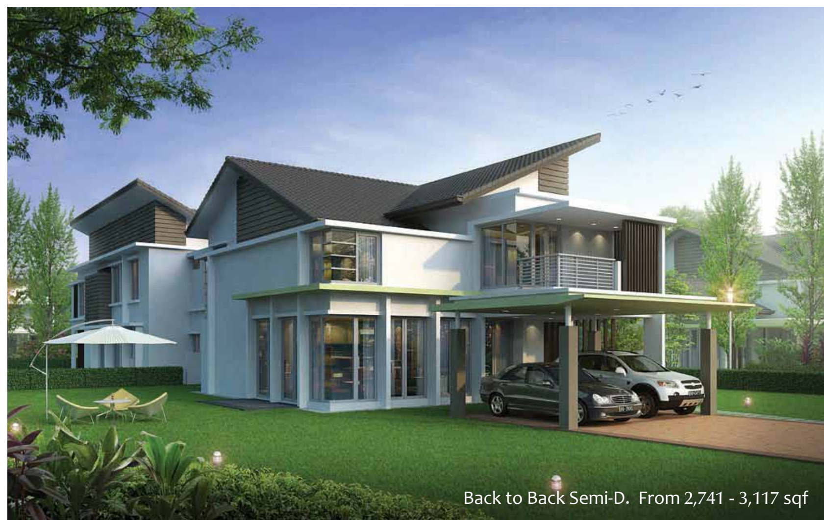
Back to Back Semi-D. From 2,741 - 3,117 sqf