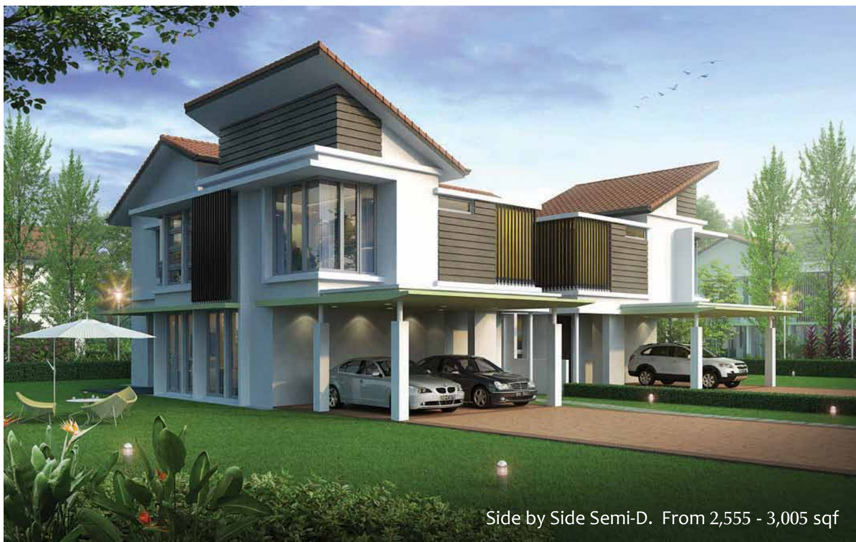
Side by Side Semi-D. From 2,555 - 3,005 sqf

FREEHOLD Legal Fee and Stamp Duty on Transfer (SPA) to be absorbed by the developer**