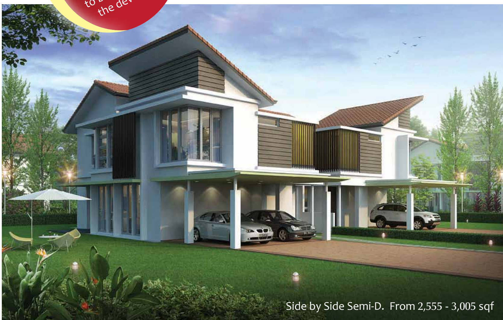
Side by Side Semi-D. From 2,555 - 3,005 sqf

Legal Fee and Stamp Duty on Transfer (SPA) to be absorbed by the developer*