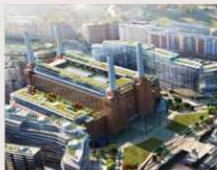
Battersea Power Station Project Power Station | 188 Kirtling Street, London