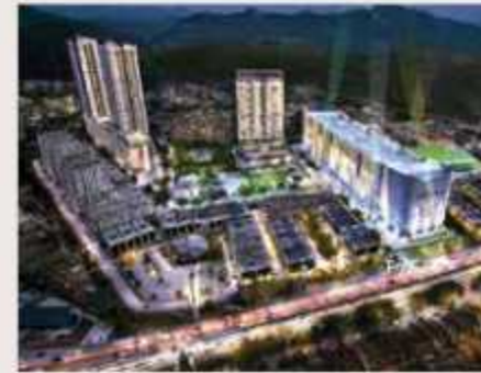
Melawati Township | Taman Melawati