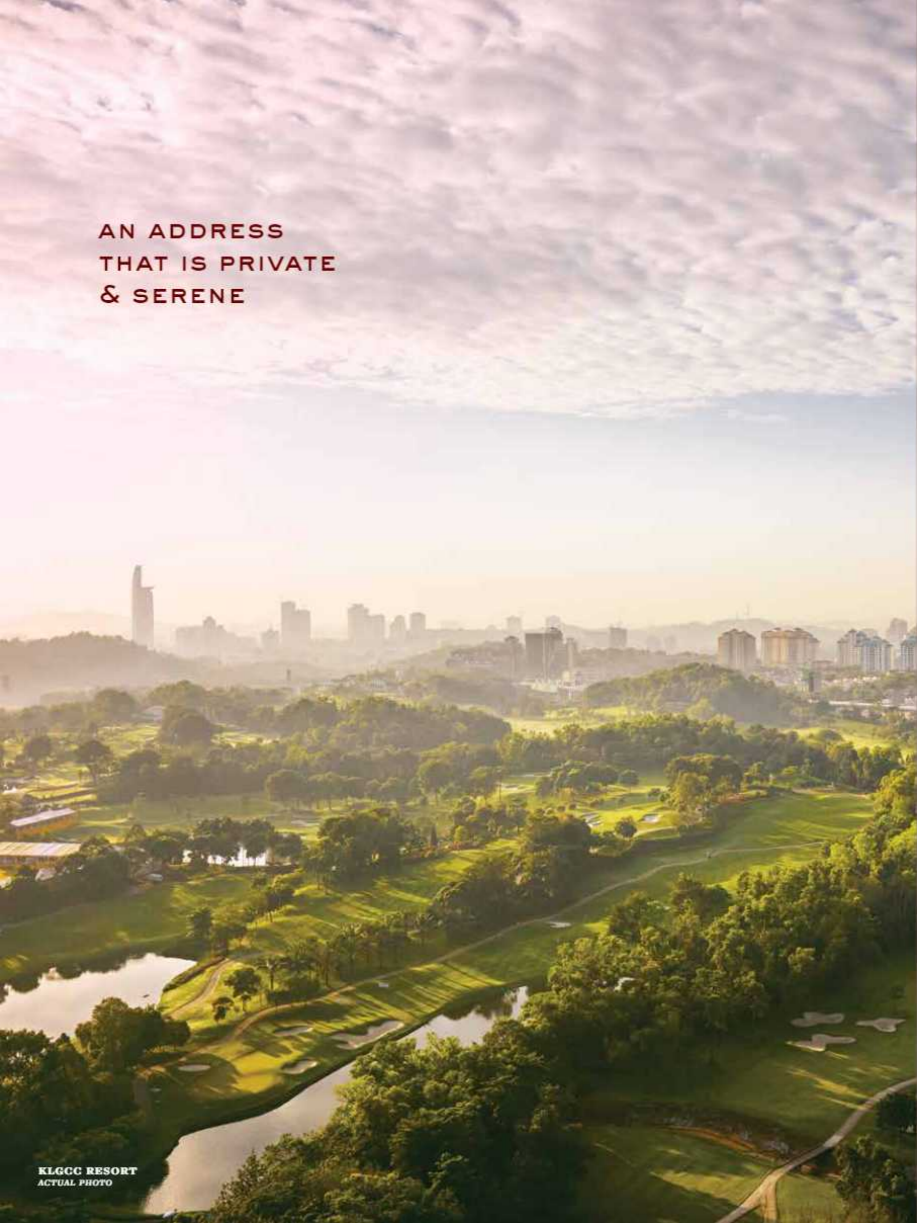
KLICC RESORT ACTUAL PHOTO

KLICC Resort is an affluent address surrounded by the liveliness of Damansara Heights, Taman Tun Dr. Ismail, Mont'Kiara, Sri Hartamas and Bangsar.