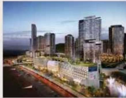
KL East Township | Melawati