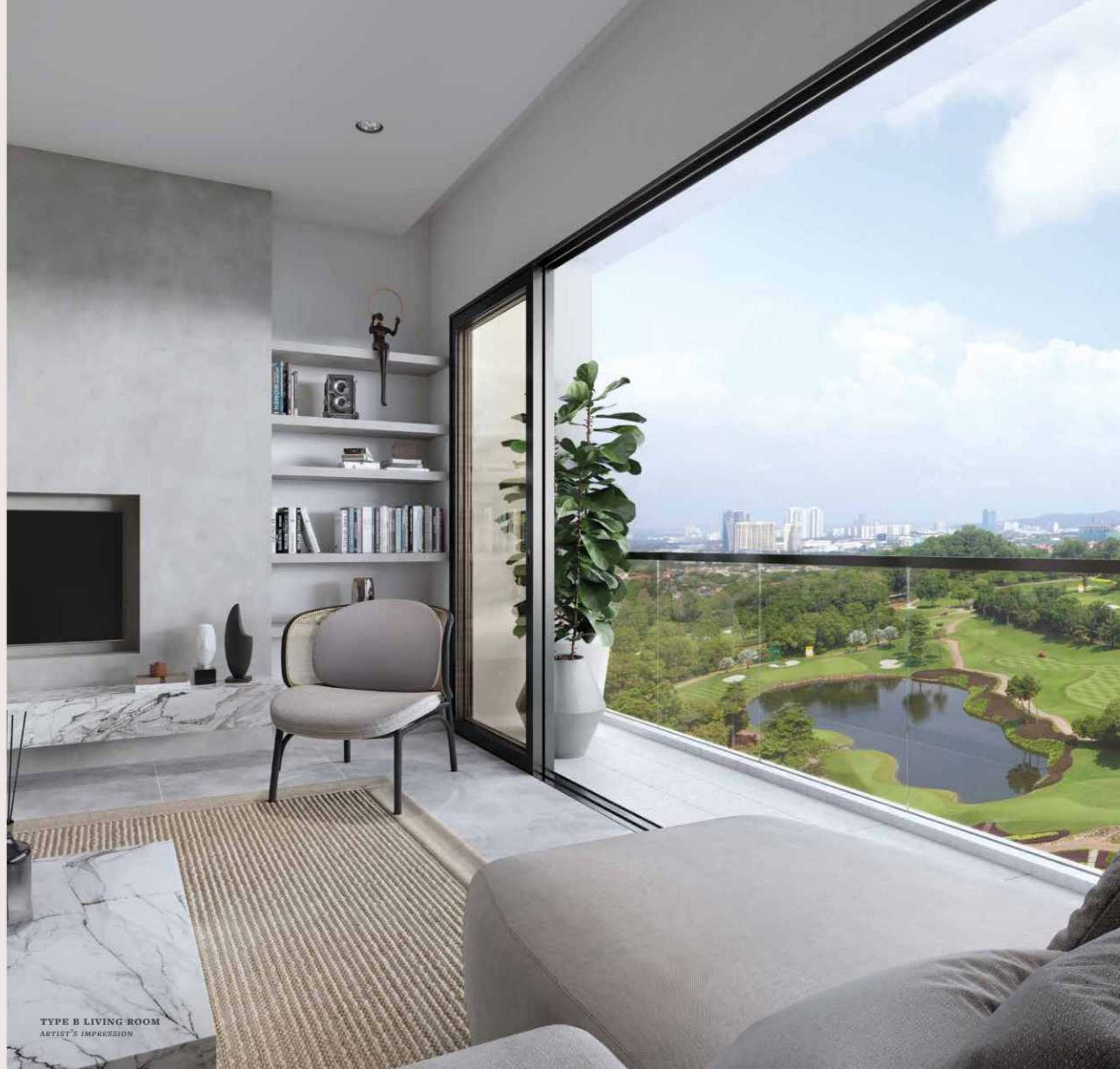
TYPE B LIVING ROOM ARTIST'S IMPRESSION