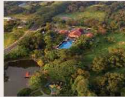
Planters' Haven Township | Negeri Sembilan