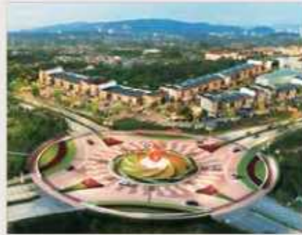
City of Elmina Township | Bandar Saujana Utama

Sime Darby Property is Malaysia's biggest property developer in terms of land bank, with 19,977 acres of remaining developable land with a total estimated GDV of RM86.9bil. Our excellent track record in developing residential, commercial and industrial properties is represented by the 24 strategically located and active townships, integrated and niche developments built to date. These townships and developments are connected to major highways and transportation hubs within key growth areas from the central region of Klang Valley to Negeri Sembilan and Johor in the South. With assets and operations across the Asia Pacific region, we also have a global presence in the United Kingdom as the developer of the iconic Battersea Power Station project in central London.