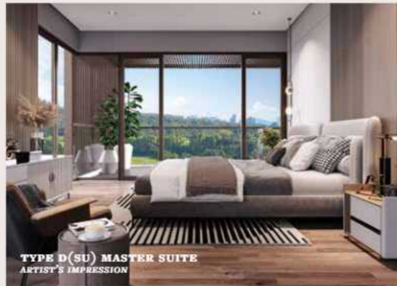
TYPE D(SU) MASTER SUITE ARTIST'S IMPRESSION

Homes at Jendela Residences are designed to reflect the highest standards of aesthetics and build quality. It is accompanied by generous interiors that are key to offering freedom of movement, function and design expression of each home. This mirrors the concept of spaciousness adopted by the environment surrounding Jendela Residences.