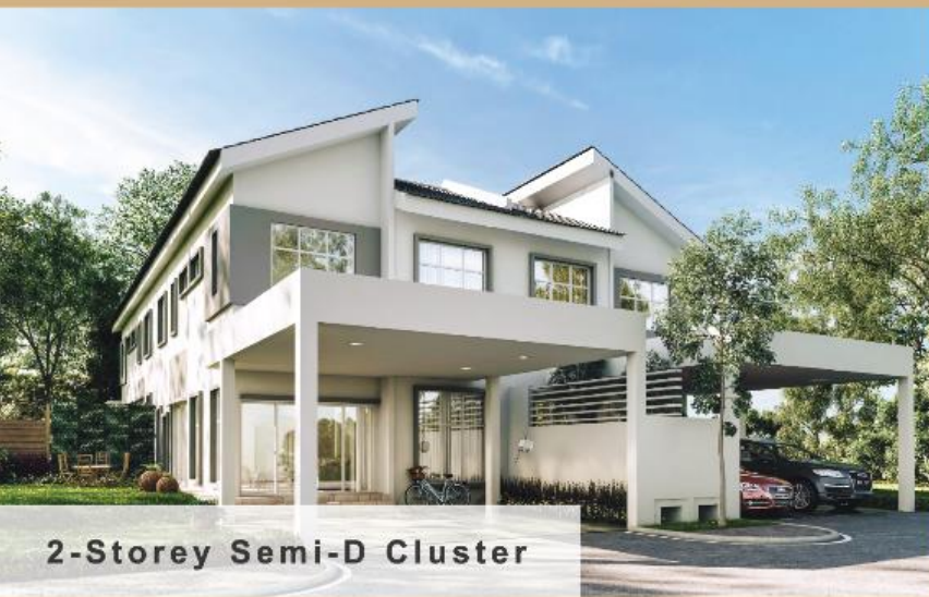
2-Storey Semi-D Cluster