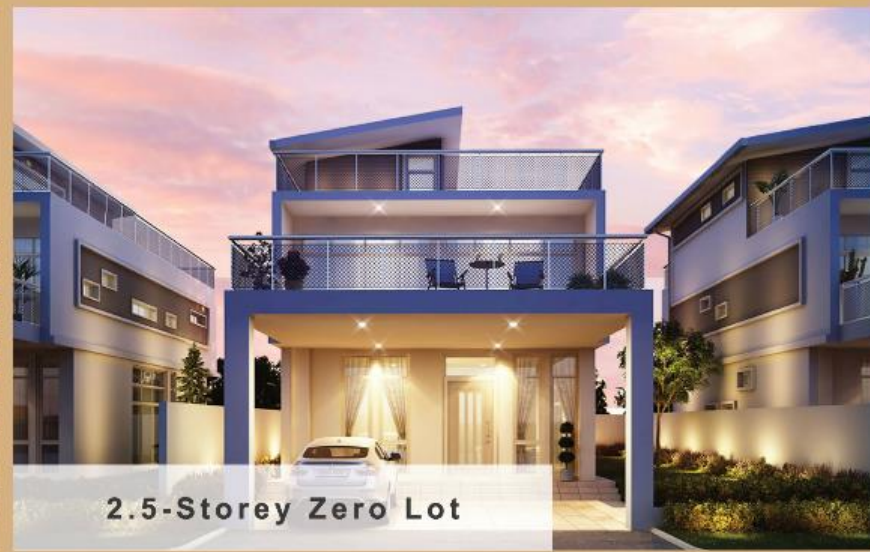
2.5-Storey Zero Lot