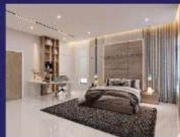
◆ MASTER BEDROOM