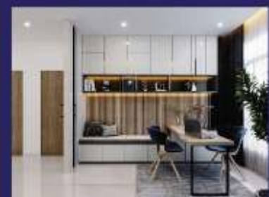
◆ FAMILY HALL